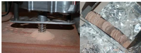
Figure 4 Sandstone core drilled by PROMPT

The coring auger penetrated 5% moisture frozen compacted CHENOBI, sandstone and basalt to depth and captured sample.