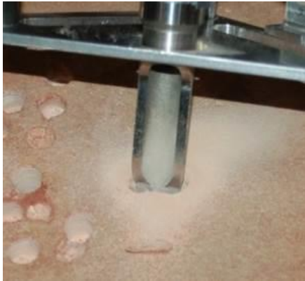
Figure 3 PROMPT chisel in sandstone

The scoop tool was capable of collecting shallow surface samples, and may be a better choice of tool for unconsolidated materials. A chisel edge is incorporated into the scoop to enable fracturing of surface features. The chisel successfully chiseled a trough in sandstone.