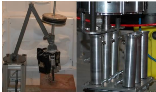
Figure 1 PROMPT on a static arm (left), TBMM (right)

Introduction: Deltion Innovations has developed a small, light, low power multipurpose tool. The Percussive and Rotary Multi-Purpose Tool (PROMPT) prototype includes a set of bits and bit handling and change out mechanism (TBMM) suitable for operations in moon and Mars analogue environments. PROMPT is intended to be used on the end of a manipulator arm and is functional in any orientation. The Tool Bit Management Module (TBMM) is a storage unit for a variety of tools that will store and present a suite of tools for PROMPT use during any of its various work cycles. The TBMM is a passive device and is typically installed on a rover chassis.